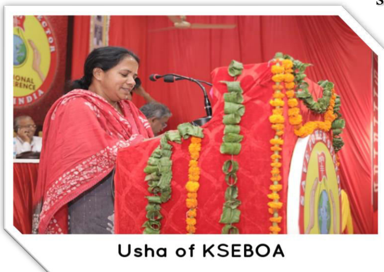
Usha of KSEBOA

support of their capitalist friends, has raised the working hours to 12 hours, removed bar on night shift, thus the health of women employees has been put to a big question. The issues like equal remuneration, equal